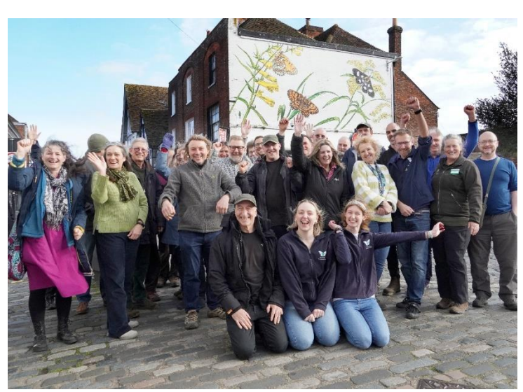
Kent's Magnificent Moths Project Staff, Partner Organisations and Volunteers at the End of Project Celebration Event and Wall Mural Unveiling in Canterbury (Jim Higham)

Finally, Fiery Clearwings have gone from one of the UK's rarest clearwings to the most frequently recorded clearwing in Kent with 5,846 eggs counted in 2023! Volunteers learnt to identify eggs which revealed their distribution is increasing. As availability of foodplants at traditional coastal sites decreases, females have laid eggs in a wide range of habitats as they move inland. New