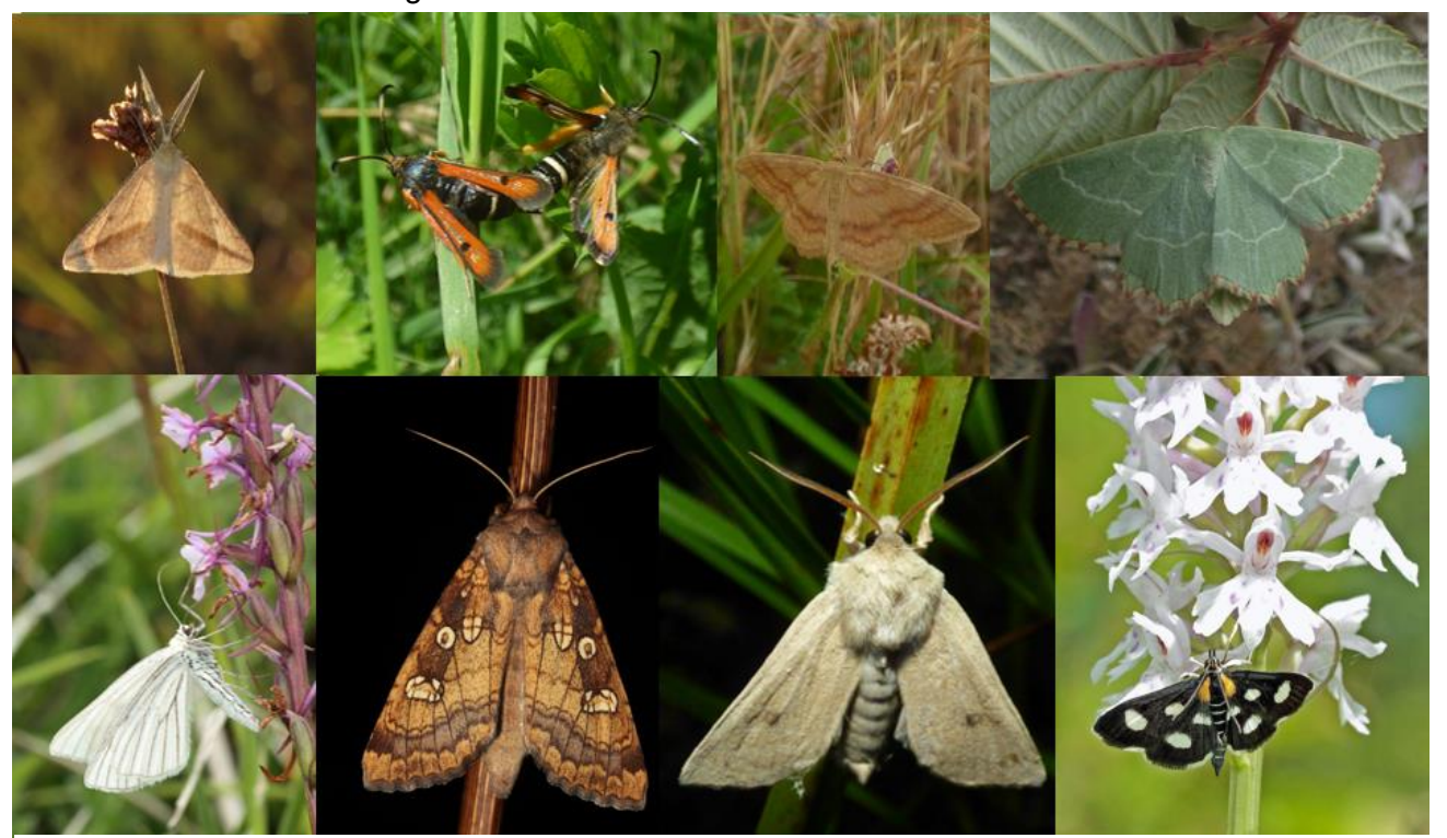
Top Row Left-Right: Straw Belle, Fiery Clearwing, Bright Wave, Sussex Emerald. Bottom Row Left-Right: Black-veined, Fisher's Estuarine, Marsh Mallow, Anania funebris

discovering the moths' larval preferences at this site so that further habitat creation in the area can be fine-tuned to benefit the Bright Wave.