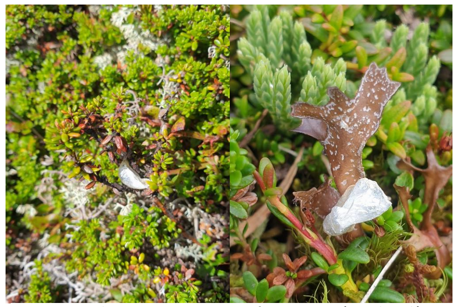
Figure 2. Vacated Mountain Burnet cocoons from Ben Avon (Patrick Cook)

Judith and David Elston carried out a survey around Loch Phadruig and surrounding hills. It has long been suspected a colony exists in this area as the habitat looks highly suitable and there is an old unconfirmed record of the moth from this location. Three individuals were seen at Creag Loisgte, including one very fresh individual and another individual at Meall an t-Slugain. This confirms there is a colony in the area and further work will be needed to confirm whether a hotspot occurs (as with Culardoch) or if the population exists at a low density across a wider area (similar to