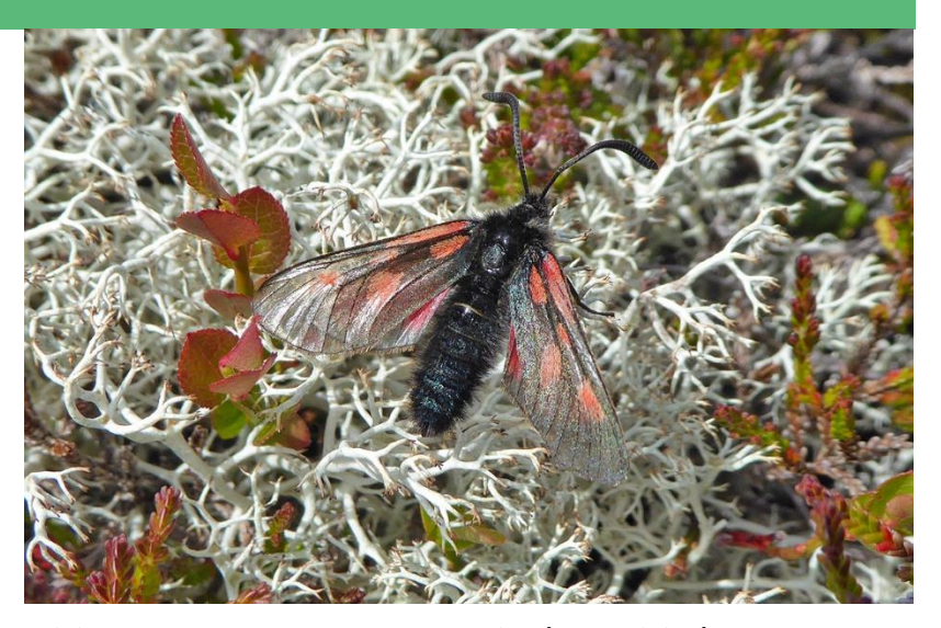
Adult Mountain Burnet on Carn nan Sgliat.

To improve our understanding of how the species is faring, monitoring commenced in 2020 using standard butterfly monitoring protocols, namely transects and timed counts. A transect, which is walked weekly on one hill,