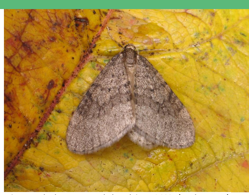
Winter Moth, the most recorded moth in JMC 2024 (Mark Parsons)

The 2024 challenge saw participation by 86 recorders from 46 different vice-counties, from VC3 South Devon up to VC103 on the Isle of Mull. Together they recorded nearly 4,000 moths (3,189 macro-moths of 38 species and 777 micro-moths of 43 species). Hopefully with your help we can make January Moth Challenge 2025 even more successful.