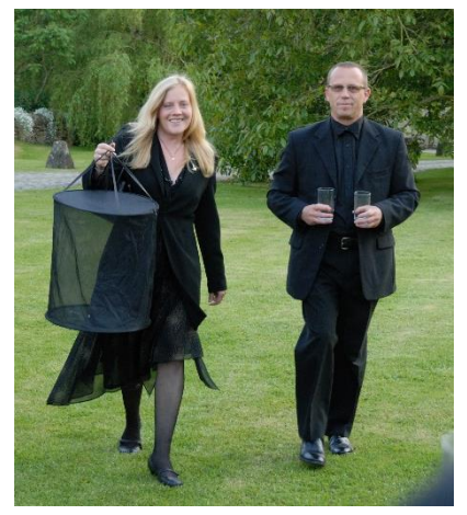
Butterfly Ball 'gate crashers'

2010, the NMRS held 11.3 million moth records, each and every one imported by Les. Les then used these data to publish the first ever complete set of macro-moth distribution maps for the UK in the Provisional Atlas of the UK's Larger Moths (2010). Les later played a huge and vital role in the work to